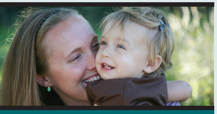
Our goal: safe families, workplaces and communities

Consultant for Compliance, Health Facilities Division, Los Angeles County Department of Public Health, Los Angeles, CA